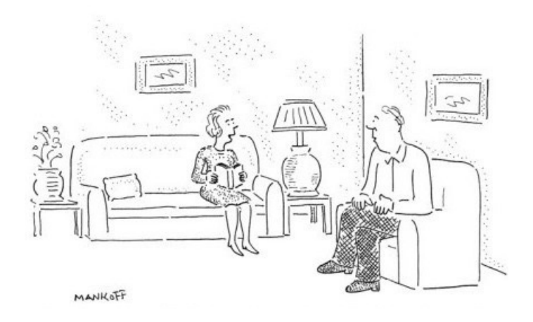
"I'm sorry, dear. I wasn't listening. Could you repeat what you've said since we've been married?"

In a several sentences, say what the problem is, what you found out or will argue for, and why it's important—in simple language. This could be as short as a sentence, or as long as about 125 words. You are forecasting the arc of the story. It's best to do this without slides, because you are establishing a personal connection between yourself and the audience. For this, slides get in the way. Good dinner conversation needs no slides.